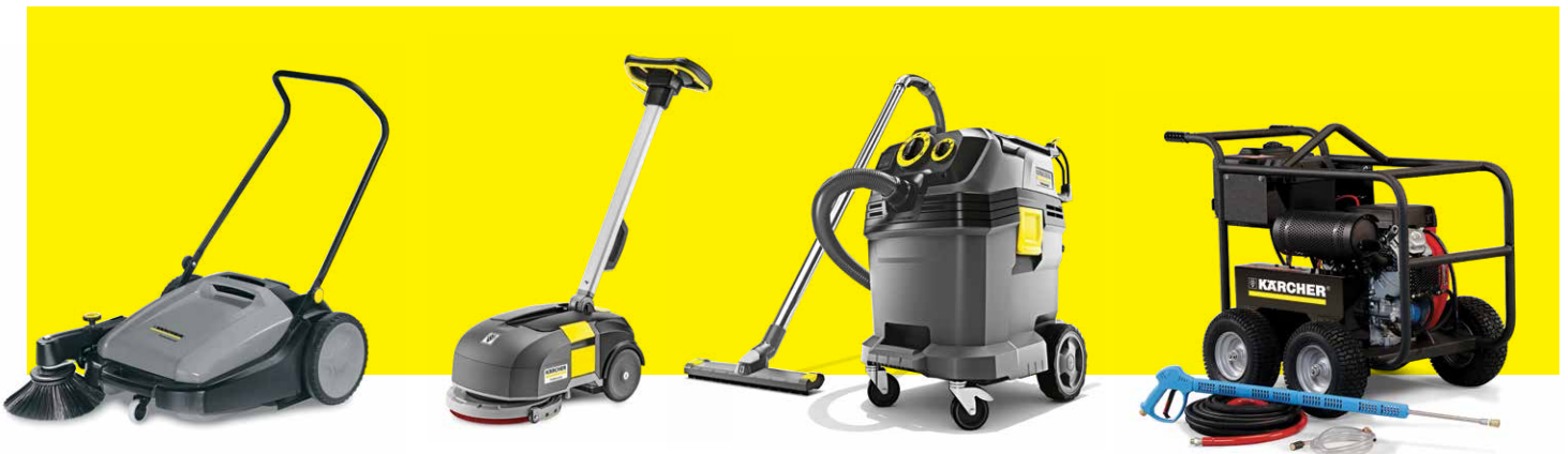
KM 70/20 Sweeper