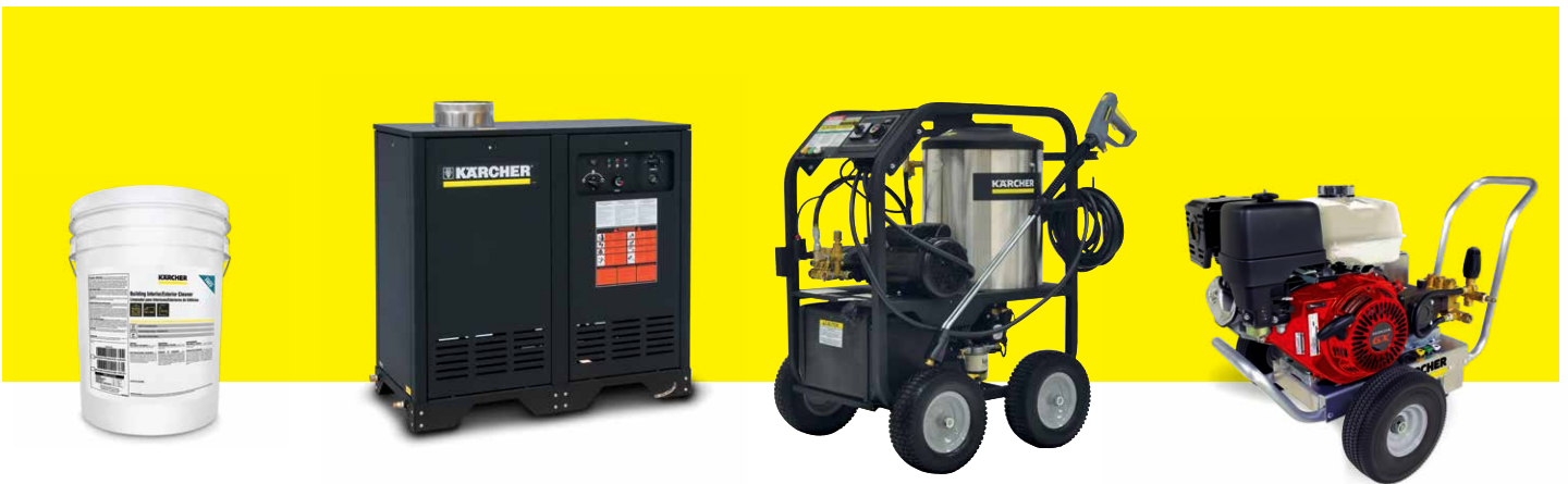
Heavy Equipment Detergent HDS 4.8/30 Ea St Ng Pressure Washer HDS 3.5/20 Ea Cage Pressure Washer HD 4.0/40 GB Pressure Washer

The HDS 3.5/20 Ea Cage hot water pressure washer is designed for use at a farm where electricity is available. It uses up to 2000 PSI and features flat free tires while the HD 4.0/40 cold water pressure washer is corrosion resistant and lightweight and can be used as a cart or a skid for maximum cleaning versatility.