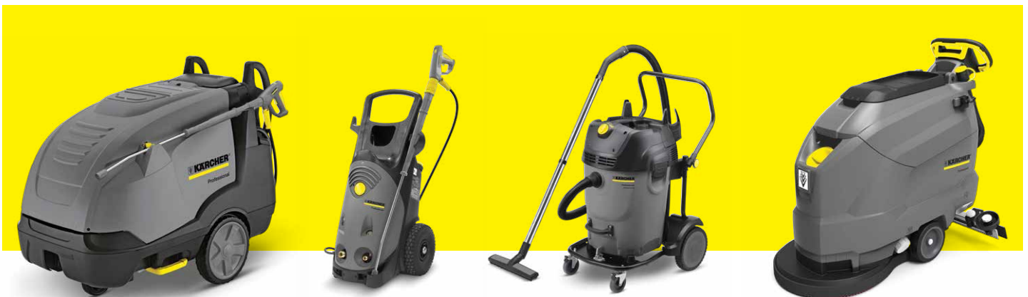
HDS 3.9/20 Ea Pressure Washer

Our NT 65/2 wet/dry vacuum is easy to operate and is built tough for your professional needs. It even features a self-cleaning filter and 17.2 gallon container capacity. The BD 50/50 C Classic Bp scrubber is economically designed and can take on large jobs. With three cleaning modes, it makes it simple for any operator to get the job done right.