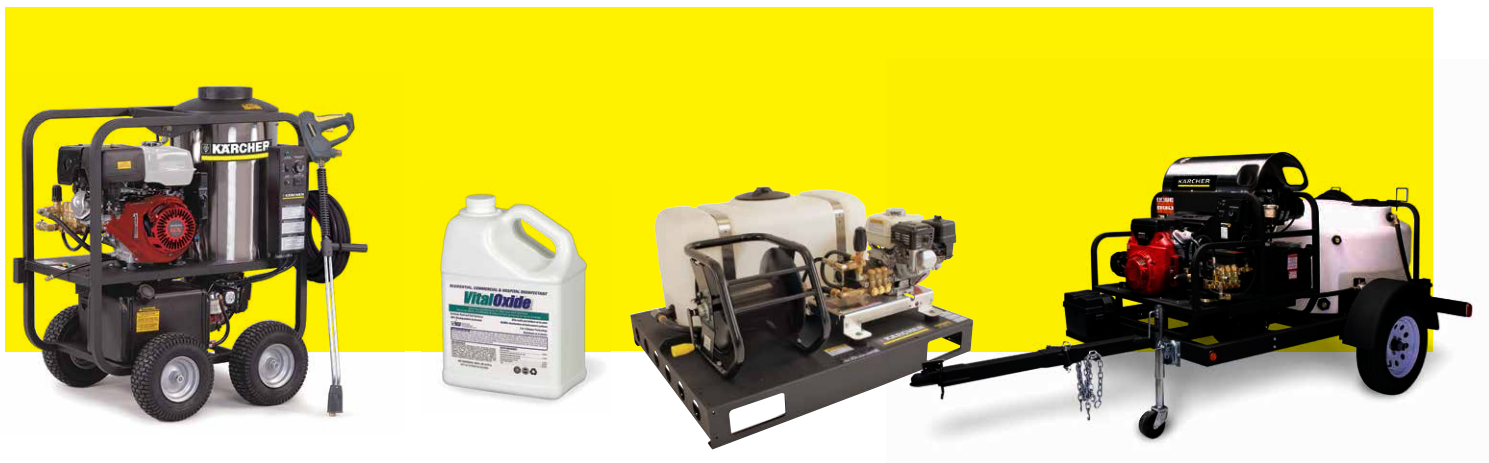
HDS 3.5/30 P Cage Pressure Washer

With mobile cleanings solutions like the truck or ATV mounted HD Series Gas Skid pressure washer, or the TRK-2500 trailer pressure washer, you can clean huts and sheds in the field or near the barn. Each is equipped with it's own water tank so you're not tethered to a garden hose.