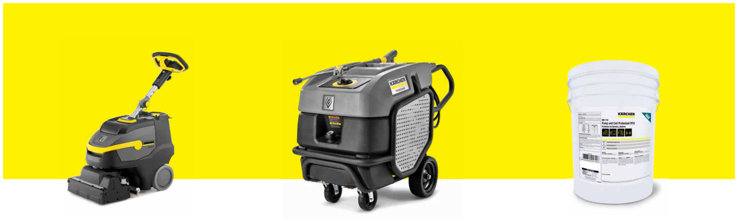
BR 35/12 Scrubber

Kärcher's extensive line of detergents can assist in every cleaning situation, such as the shop floor cleaner – formulated for heavy-duty clean up of oil and grease.