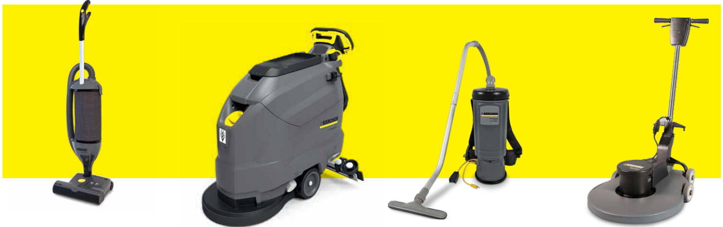
CV 300 Vacuum

The BV 11/1 HEPA is a portable back mounted vacuum great for increasing productivity, while saving you money. The BDP 51/2000 C burnisher can restore your floors back to their original shine, all while putting the safety of the operator first.