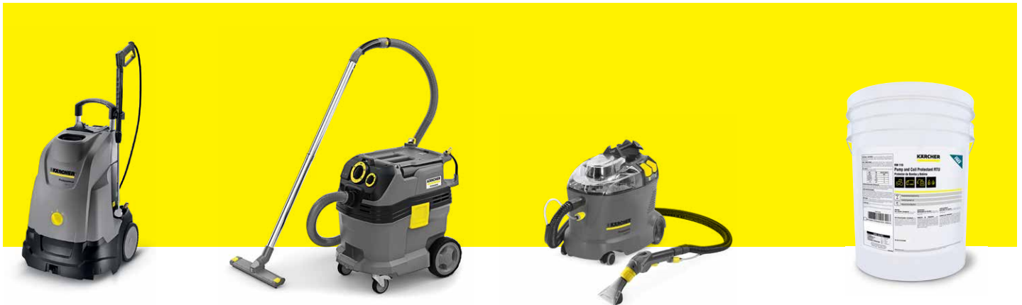
HDS 1.7/12 Pressure Washer

Kärcher offers the compact Puzzi 8/1 C extractor - perfect for cleaning seats, carpets, and headliners. The Kärcher Vehicle Wash and Wax detergent saves time and money when you clean and protect in one step. The detergent is safe for any vehicle finish and works exceptionally well in hard water, leaving a shine with a spot-free rinse.