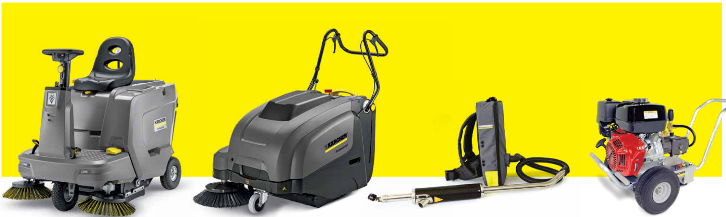
KM 85/50 R Bp Sweeper

We keep things clean so you, and your customers, can focus on the cars. You will be confident in the clean achieved with our sweepers, pressure washers, and gum removers. Kärcher puts cleanliness first, keeping your main traffic routes sparkling and spotless.