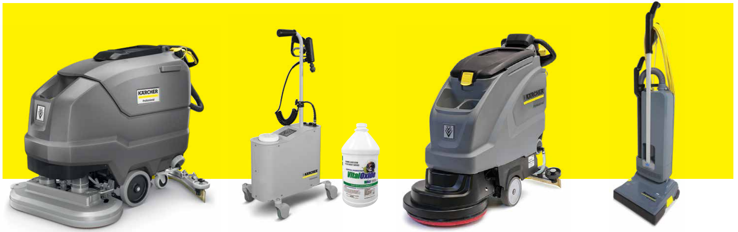
BD 80/100 W Bp Classic Scrubber