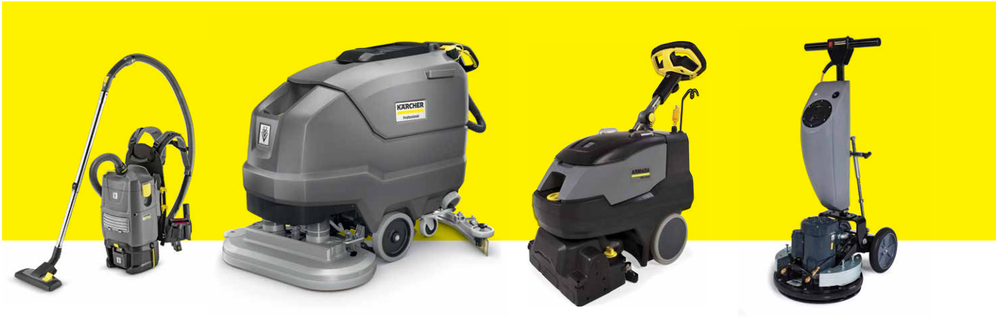
BV 5/1 Backpack Vacuum