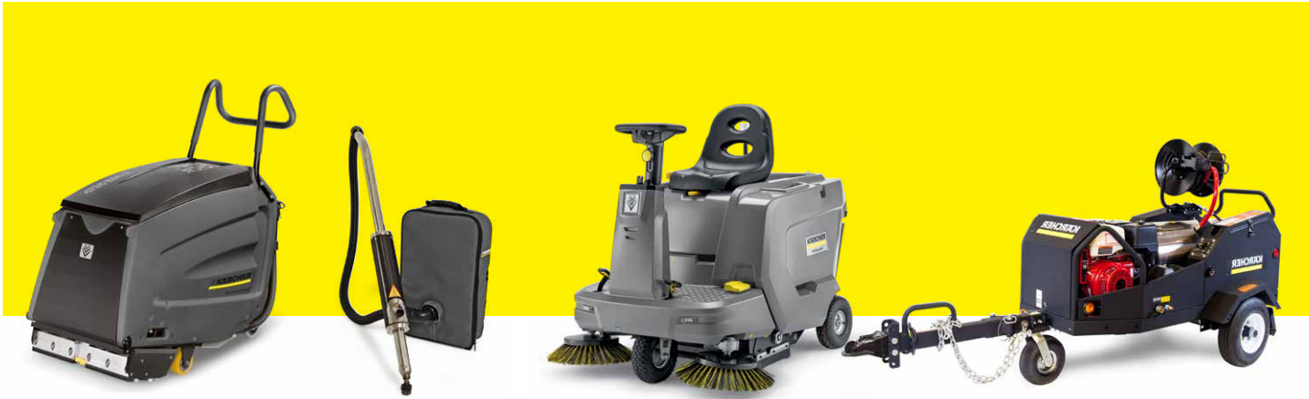
BR 47/35 Escalator Cleaner