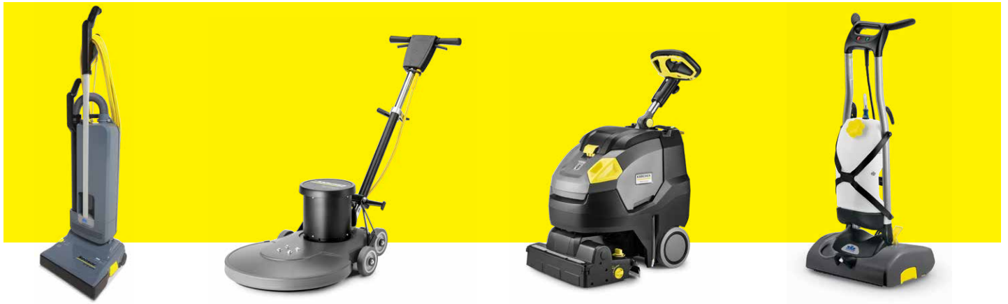
Sensor S2 HEPA Upright Vacuum