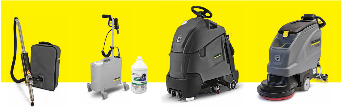
SG1 C Bp Gum Remover