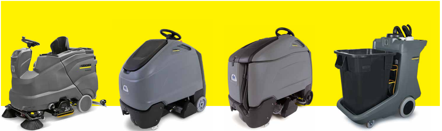
B 150 R Bp Sweeper