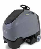
Chariot™ 3 CV 86/1 RS Bp