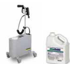
Kärcher PS 4/7 Bp Mister Vital Oxide - 1 Gallon