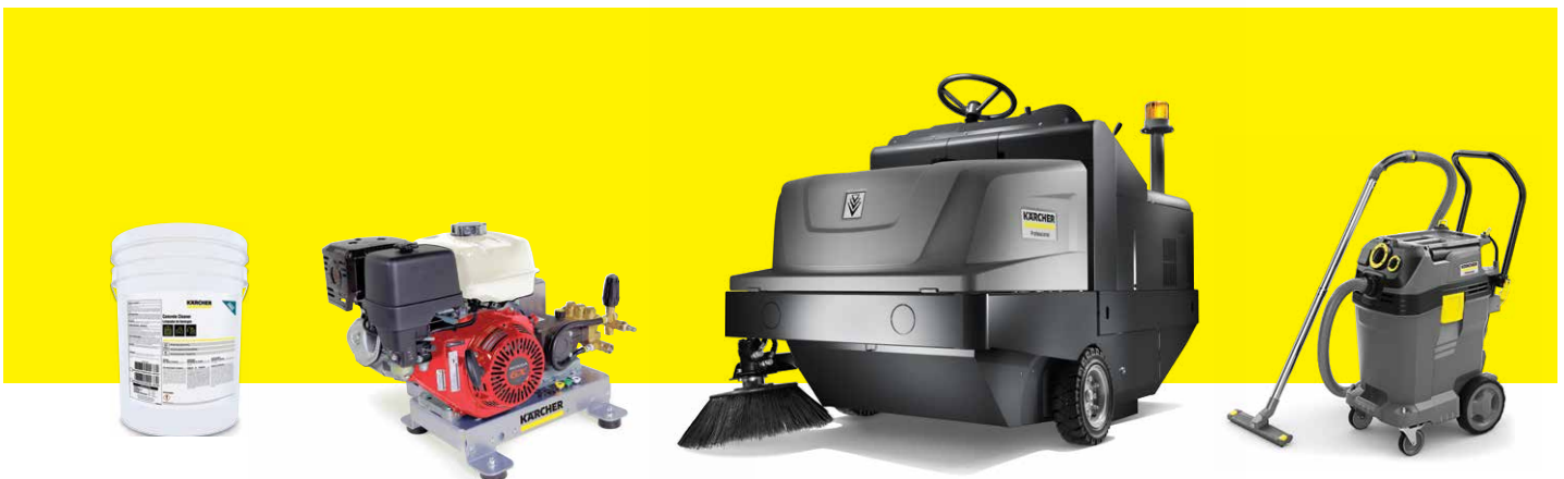
Concrete Cleaner Detergent

Kärcher's KM 105/110 R Bp ride-on sweeper is extremely maneuverable, allowing you to quickly remove dirt and debris from large areas. The powerful NT 50/1 has standard HEPA filtration and is fully compliant for silica and dust mitigation.