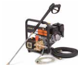
HD Hand Held