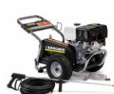
HD PB Cart