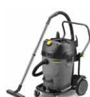
NT 65/2 TACT