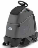
Chariot™ 2 iVac 24 ATV