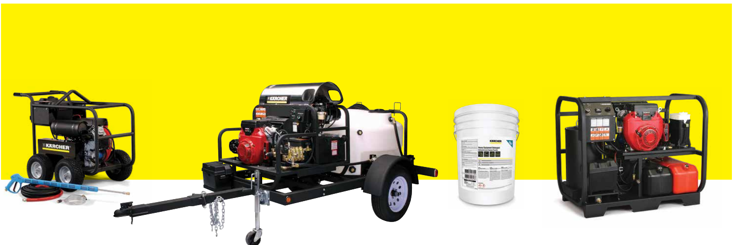
HD 4.0/50 Pe B Cage Pressure Washer TRK-2500 HDS 4.7/35 Pressure Washer Heavy Equipment Detergent HDS 3.5/35 Pe Cage Pressure Washer

Kärcher's Heavy Equipment Detergent is an effective and safe detergent that can be used on any surface. It is excellent as a pre-spray for softening and breaking up caked-on soils like mud, greasy film, diesel fuel, and lubricants. Use a HDS 3.5/35 Pe Cage hot water pressure washer to clean equipment at up to 3500 PSI.