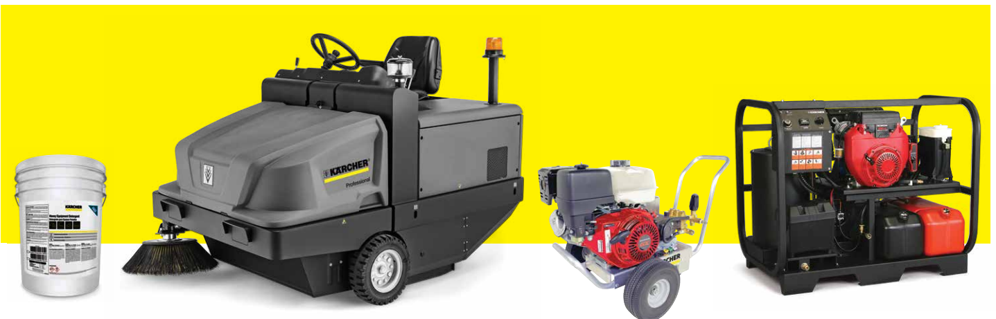
Heavy Duty Brown Detergent