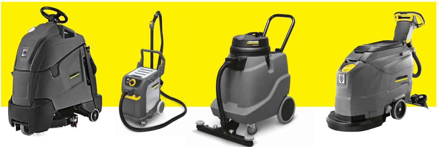
Chariot 2 iScrub 20 Deluxe Scrubber