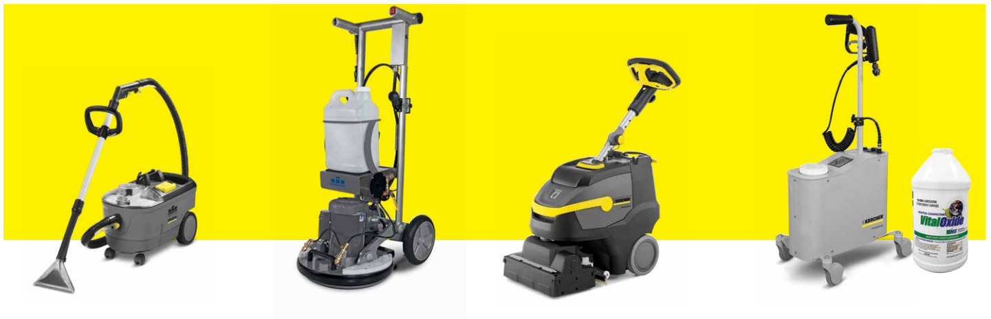
Puzzi 10/1 Extractor