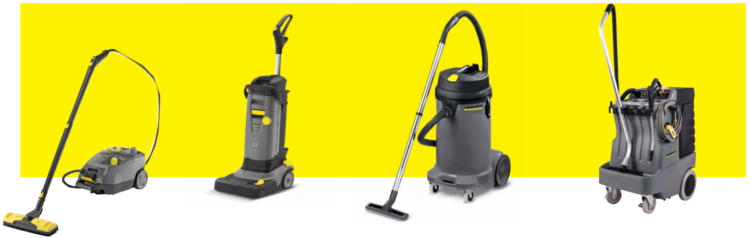
SG 4/4 Steam Cleaner

The NT 48/1 wet/dry vacuum cleaner quickly picks up water from restroom floors, leaving floors dry, to reduce slips and falls. The Compass 2 surface cleaning machine accurately dispenses cleaning solution, then rinses and vacuums the surface completely dry in less time than conventional cleaning methods.