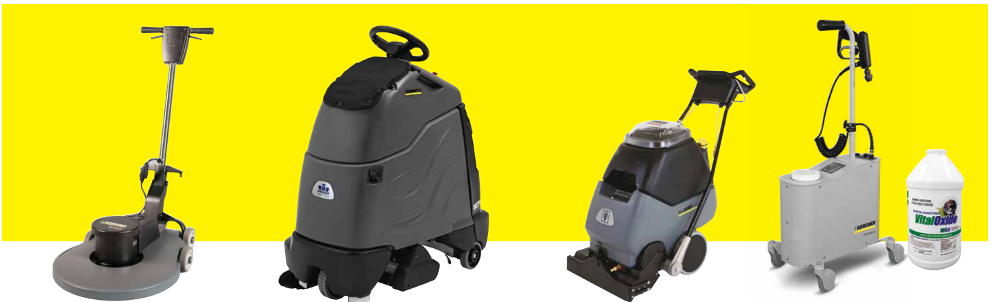
Lightning 2000 Burnisher

Kärcher's Clipper 12 extractor will clean even the dirtiest carpets with confidence and power. The user friendly design and durability makes this the perfect extractor for your hospital offices. The PS 4/7 Bp mister with Vital Oxide is a hospital grade disinfectant system. Spray Vital Oxide through the mister onto any surface to kill harmful bacteria and viruses.