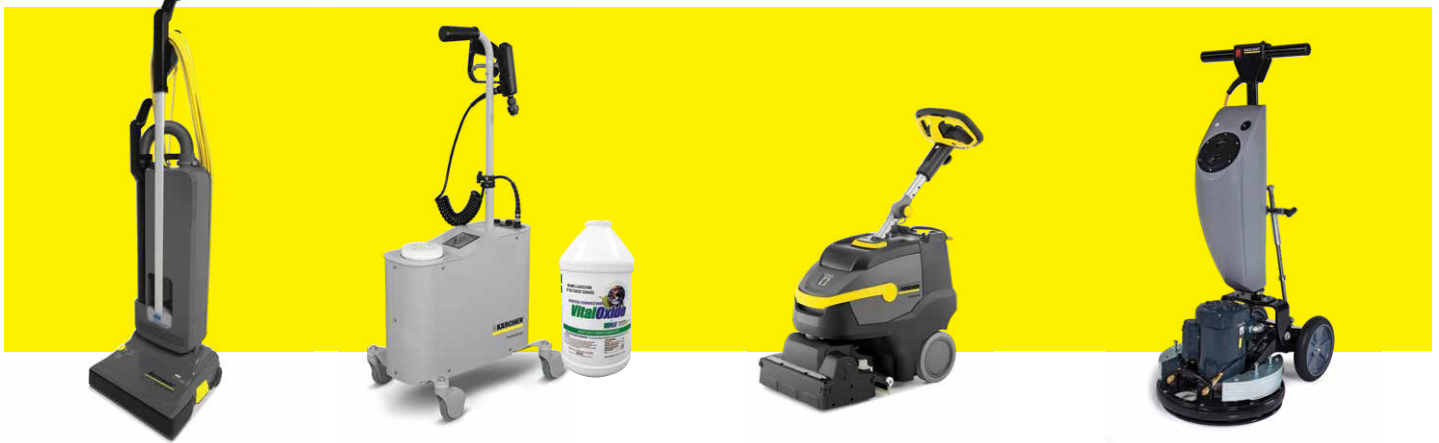
Sensor S2 HEPA Upright Vacuum

The compact BR 35/12 C Bp floor scrubber is a lightweight battery-powered scrubber that prevents slipping and leaves the floor dry immediately after cleaning. Use the Radiant floor machine with ORB technology to brighten stone floors, clean carpet, make tile & grout shine, simple to use. This machine is the jack-of-all-trades.