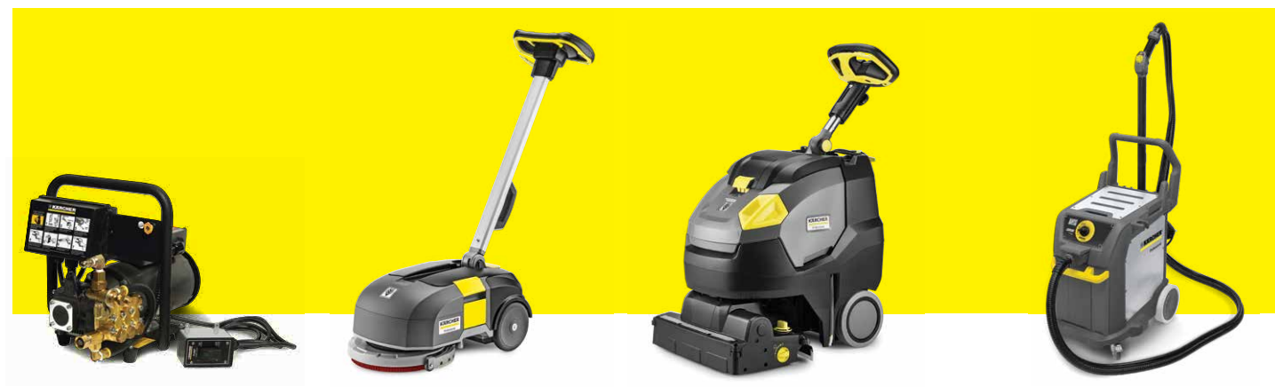
HD Wall Mounted Pressure Washer