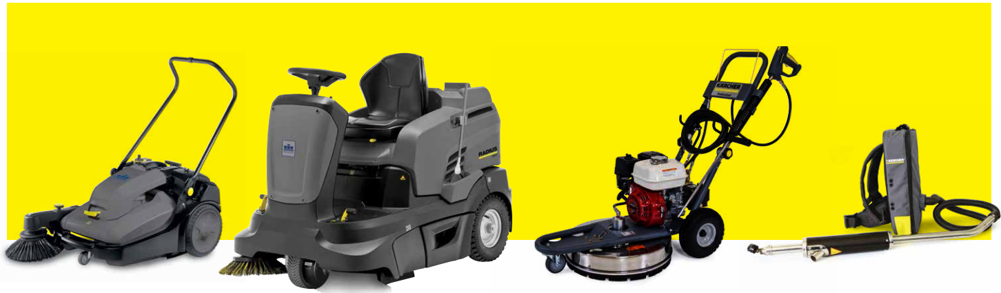
Radius 280 Deluxe Sweeper

Use the Jarvis cold-water, gas powered pressure washer to easily remove soils from sidewalks, loading docks, and dumpsters. The cordless SG 1 C Bp gum remover blasts gum quickly. With no harsh chemicals, this machine ensures safety and convenience and can be used on stone, concrete, and even carpet.