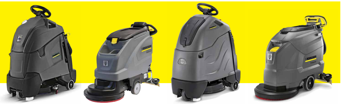
Chariot 2 iScrub 20 Scrubber

Use the Chariot 2 iGloss stand-on burnisher for a brilliant shine. This machine will increase productivity and will allow you daytime cleaning ability. The BD 50/50 C Classic Bp walk-behind scrubber was designed with you in mind. It's slimline design, 13.2 gallon capacity, and quiet noise level allow for around-the-clock scrubbing.